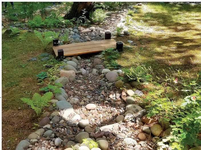
Extension Lakes/University of Wisconsin- Stephens Point

Walk your property before, during or after it rains to see where water goes. Note the physical